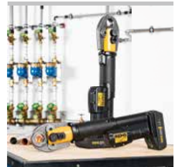
Tested by electrosuisse >>>