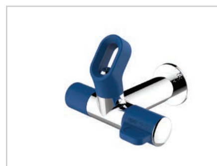
T100 Wall Mounted Bubbler

Type45 Upright Bubbler With Bottle Filler