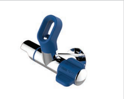
Type 63 Angled Bubbler with Bottle Filler (Suits trough) Angled back