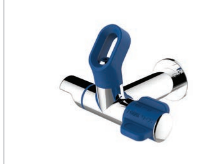
T100 Wall Mounted Bubbler with Bottle Filler

"Do you remember playing in the school yard and not wanting to miss a moment of the action?