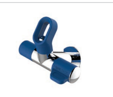
Type 63 Angled Bubbler (Suits trough) Angled back

A quick drink from the bubbler was what we did, and what kids have been doing with Enware bubblers for 80 years"